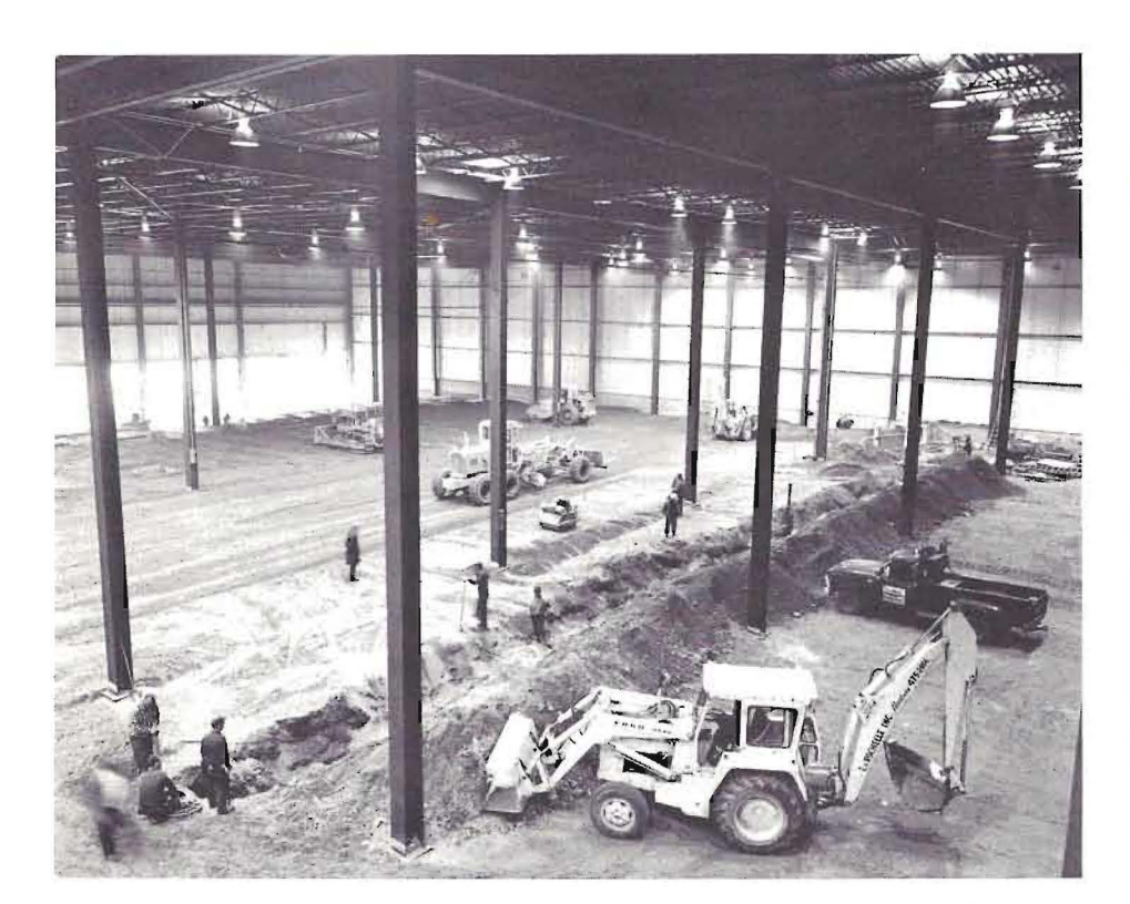
SPACE PROJECT. With huge earth moving equipment of all types at work right inside the building, this photo offers a unique view of the new Merchandise Warehouse under construction at the North Andover Plant of the Merrimack

Edward R. Hakesley, Department 131 April 15, 1969