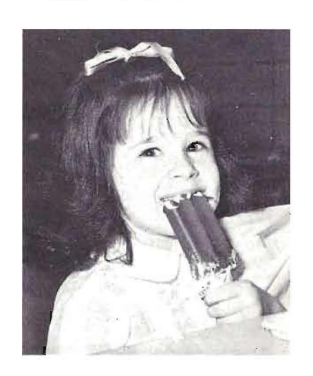
MVW Employees, Families Enjoy April 15, 17 Open House Programs