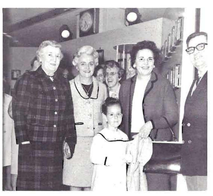
CRYSTALS of cultured quartz, grown at the Merrimack Valley Works, were the subject of interest as thousands of MVW employees and their families toured the Quartz Building while visiting the North Andover Plant during the April 15, 17 Open House Programs, which proved highly enjoyable.